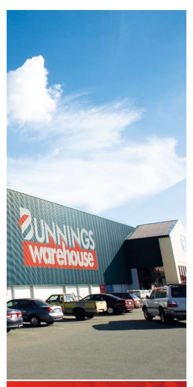
Bunnings Warehouse, Midland, WA

Two main themes for the Trust's operations will continue in the short-term: capital management to improve the efficiency, security and flexibility of funding; and asset management to continue to drive growth and value from existing properties and add quality new properties to the portfolio selectively