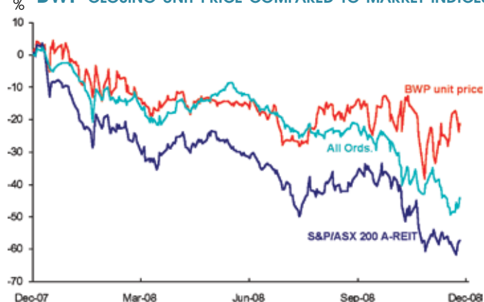
BWP CLOSING UNIT PRICE COMPARED TO MARKET INDICES

Over a more recent timeframe, BWP's closing unit price has increased by approximately 4.1% since 30 June 2008, compared with declines of 27.3% and 31.7% for the S&P/ASX 200 A-REIT and All Ordinaries indices respectively.